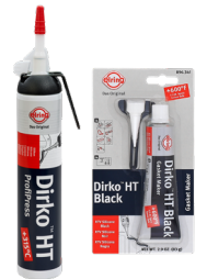
919.411 | 896.341